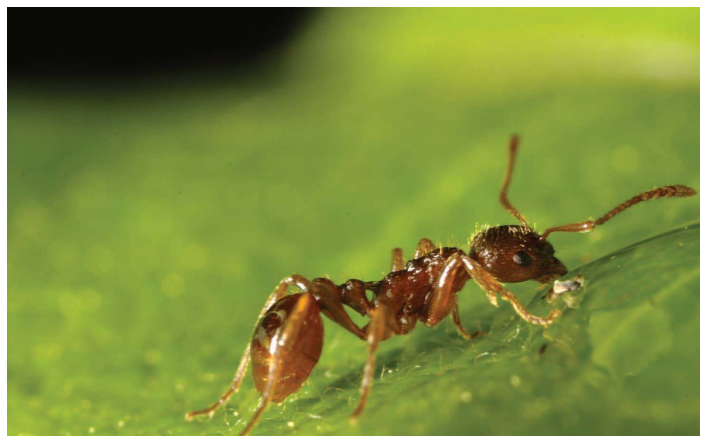
European fire ant.

Nests can be as dense as four per square metre of city back yard, making it impossible to stand on grass<sup>11</sup>. Yard and garden work is made difficult, and pets are distressed<sup>3</sup>. Parks and campgrounds can be rendered unusable<sup>11</sup>. By one estimate, the ants will cost British Colombia $100 million a year if they achieve their potential distribution<sup>3</sup>.